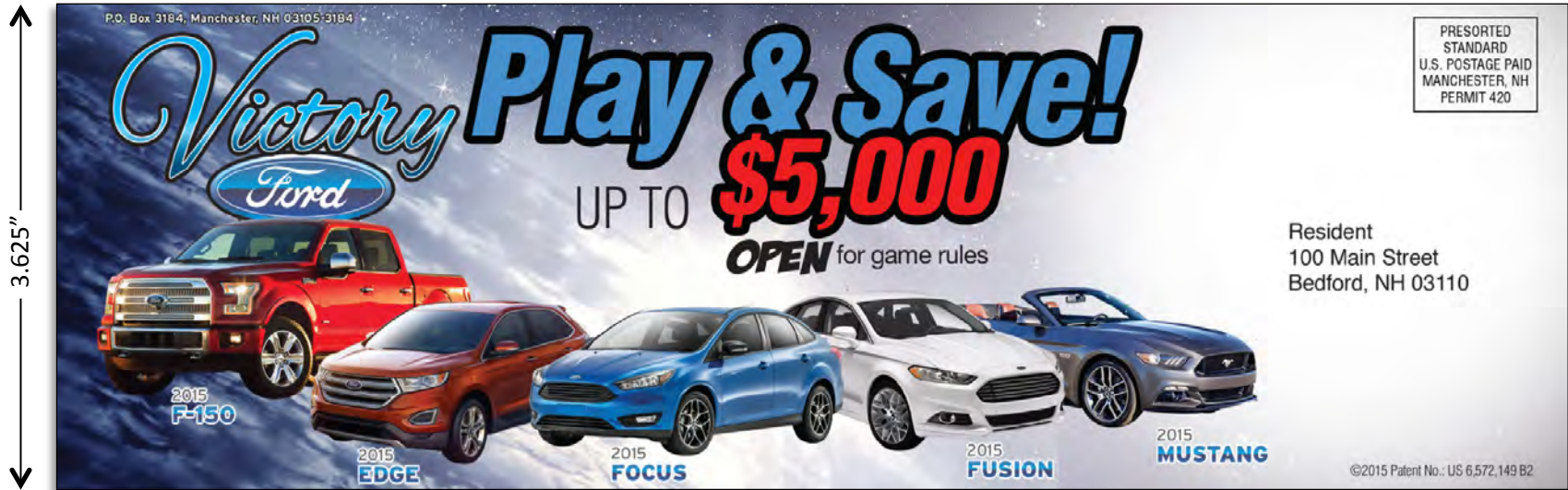
Mailer Front Cover