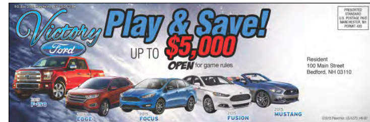
Automobile Model Example

Promotional offers are targeted to consumers minutes from local dealerships for minimal cost. BVM utilizes the benefits of saturation mailing and also provides customized list services.