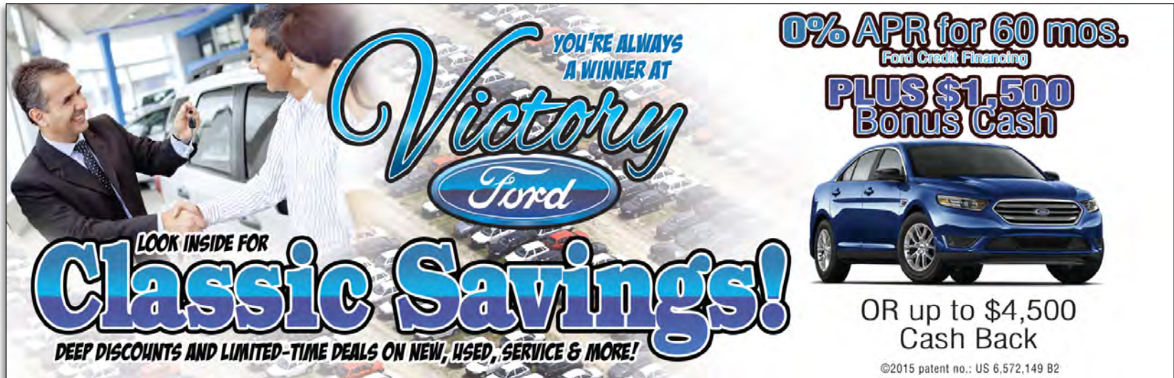
Mailer Back Cover